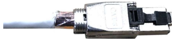
8. Close plug cover, make sure the drain wire is in proper contact with grounding clip on plug.