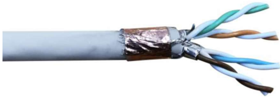
4. Fan out all four twisted pairs, following the color coding label and allocate each