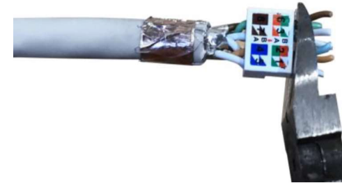
6. following the color coding label and allocate each conductor into proper slots on wiring cap. Trim the ends of conductors.