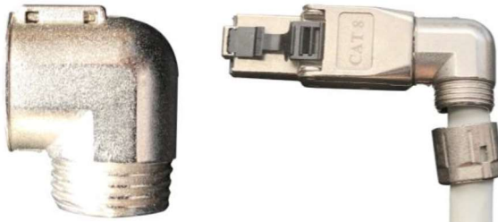
10. Use angled accessories,