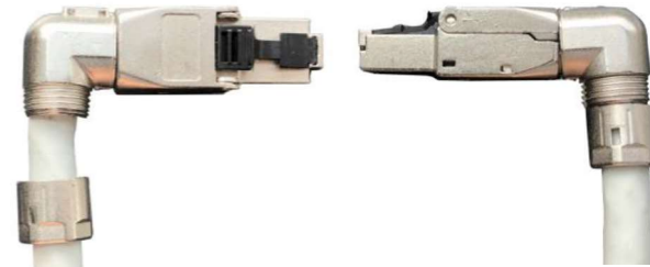
11. Can achieve 90 degree bends in 4 different directions