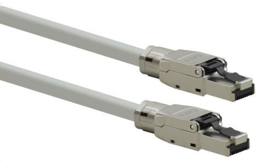
Cat 8.1 SFTP Patch cord